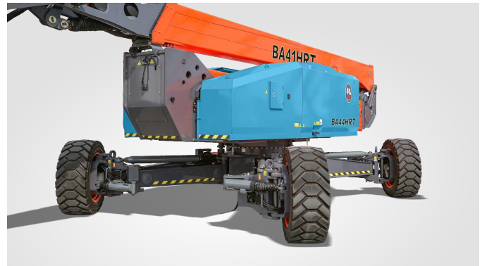
Brand New One-Key In-Situ Axle Expansion Technology Global Patent Protection