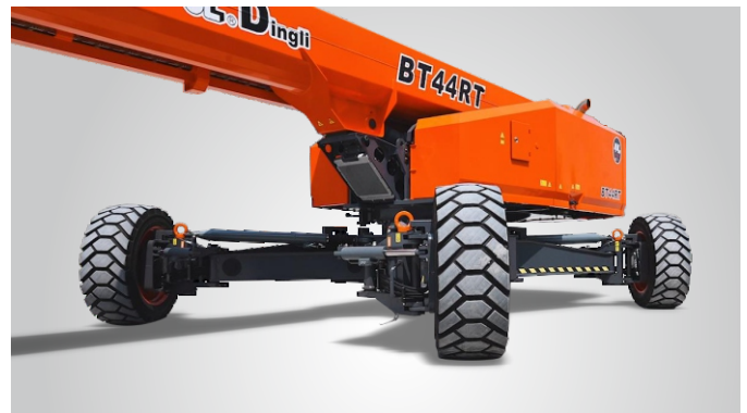
Brand New One-Key In-Situ Axle Expansion Technology Global Patent Protection