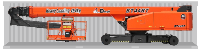
Standard Container Transport