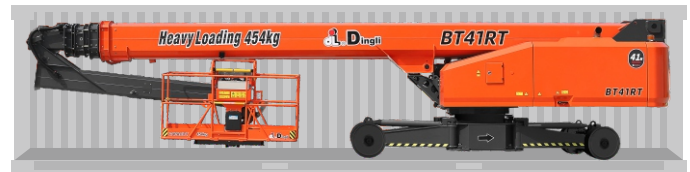
Standard Container Transport