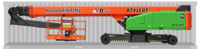
Standard Container Transport