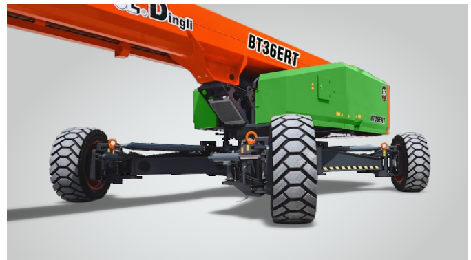
Brand New One-Key In-Situ Axle Expansion Technology Global Patent Protection