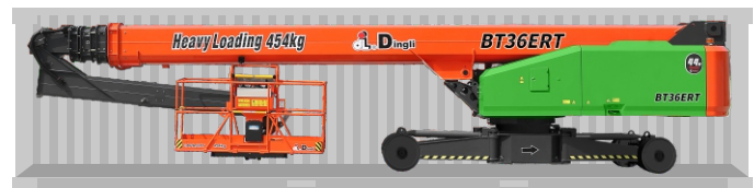
Standard Container Transport